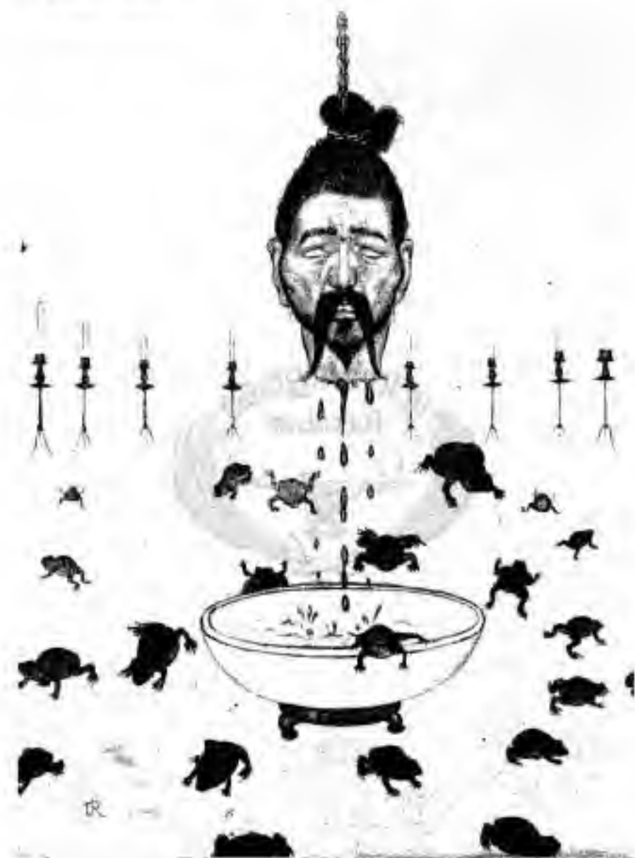
The usurper's blood changing into toads,